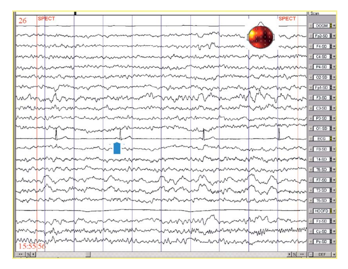
Fig. 3. — During this rhytmic \delta -activity, the heart rate decreases with an RR-interval increasing up to 3 seconds (big blue arrow)